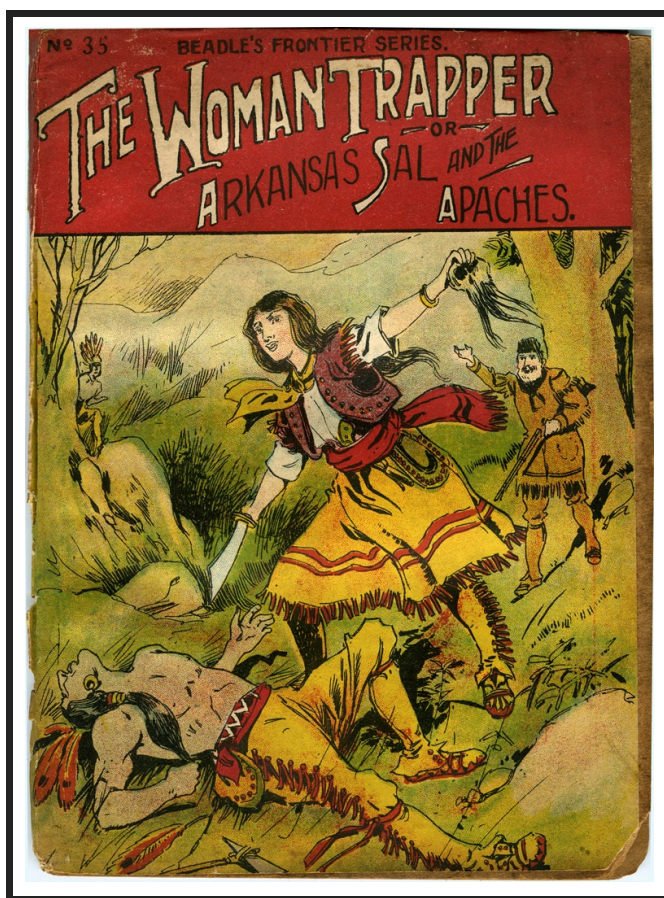
The Woman Trapper, from Beadle's Frontier Series no. 35 (1908)

Beadle's Frontier Series Dime novels 1909-1934