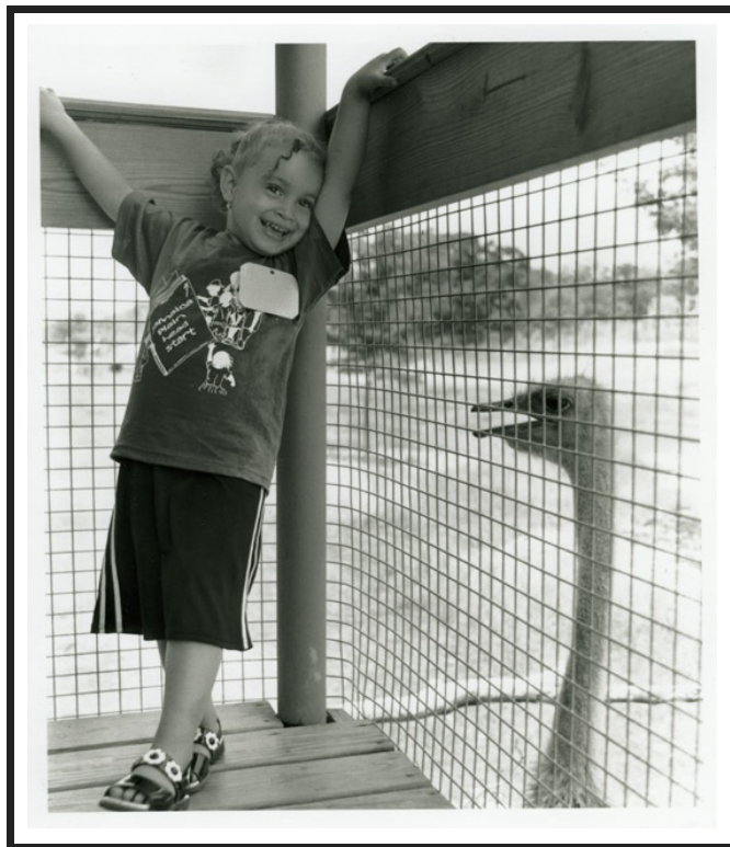
Girl and ostrich, July 9, 1999

The bi-weekly Jamaica Plain Gazette , in some cases including inserts for Hyde Park Today , and monthly Mission Hill Gazette featured articles about the residents, businesses, and organizations in their respective Boston neighborhoods in both English and Spanish. The newspapers ran articles that highlight youth programs and sports, senior services, transportation and housing issues, and the achievements of local residents. Community involvement by politicians including former Mayors Raymond Flynn and Thomas Menino, former Governor Deval Patrick, and President Barack Obama was also featured.