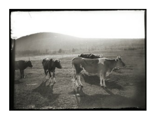
( no. 76 ) Small herd of dairy cows in pasture, Mt. Pomeroy in background.

Brooks, Burt V.: Cattle grazing on Greenwich Plain (Greenwich, Mass.) ca.1910 12.5 \times 17 cm. glass plate negative Box 1