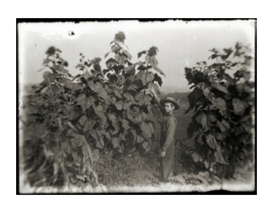
Brooks, Burt V.: Portrait of a young boy with dog (Greenwich, Mass.) ca.1910 18 x 12.5 cm. Box 6