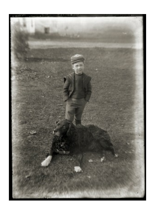
Brooks, Burt V.: Portrait of a young girl in plaid dress (Greenwich, Mass.) ca.1910 18 x 12.5 cm. Box 3