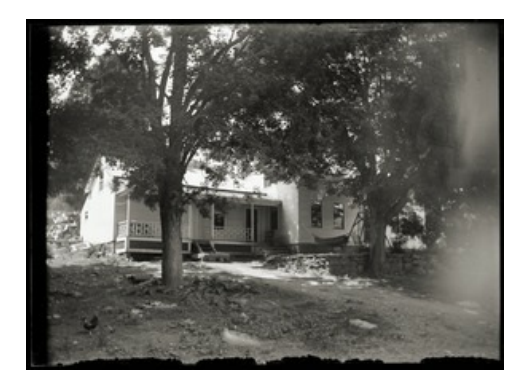
Image of front of house with ell and porch, chickens, terracing, and a hammock.

Brooks, Burt V.: Unidentified saltbox house with gambrel roof and twin dormers (Greenwich, Mass.) ca.1910 12.5 \times 18 \text{ cm} . Box 6