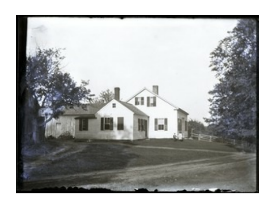
( no. 148 ) Cape-style house with ells. Possibly Greenwich.

Brooks, Burt V.: Young girl in a field (Greenwich, Mass.) ca.1910 12.5 x 17 cm. glass plate negative Box 1