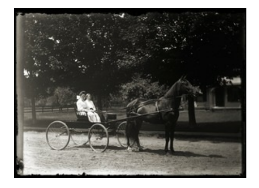
Brooks, Burt V.: Woman in a carriage, with horse, dressed for cold weather (Greenwich, Mass.) ca.1910

Two women seated in a buggy, reins in hand.