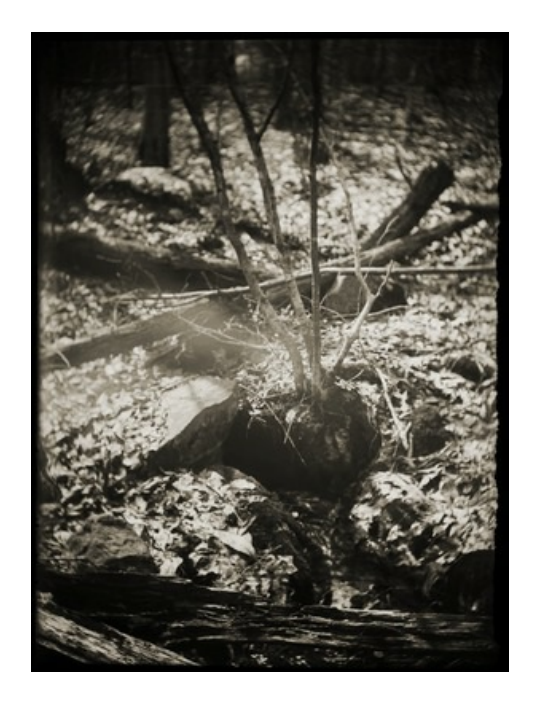
Image of roots and lower branches of a small tree, growing amongst large rocks.