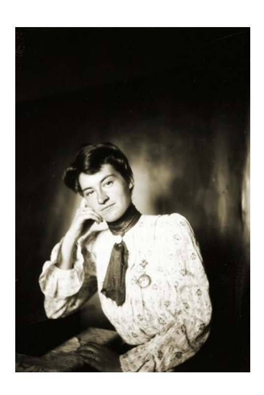
( no. 74 ) Studio portrait of young woman in contemplative pose.

Work and industry (Greenwich, Mass.) ca.1910 10 images Brooks, Burt V.: Billings sisters with milk pails (Greenwich, Mass.) ca.1910 12.5 x 17 cm. glass plate negative Box 2