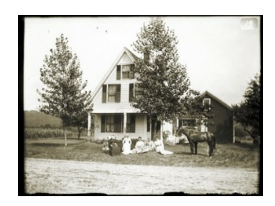
( no. 19b ) Alternate shot of group of five women posed in front of house with horse nearby.

Brooks, Burt V.: Women on a porch (Greenwich, Mass.) ca.1910 12.5 x 17 cm. glass plate negative Box 3