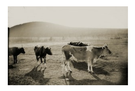
Brooks, Burt V.: Cattle grazing in a field (Greenwich, Mass.) ca.1910