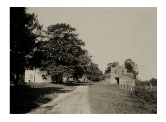
( no. 40 ) View down lane, with houses on either side.