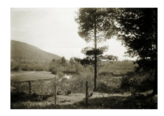
Brooks, Burt V.: Middle Branch of the Swift River (Greenwich, Mass.) ca.1910 18 \times 12.5 \text{ cm} .