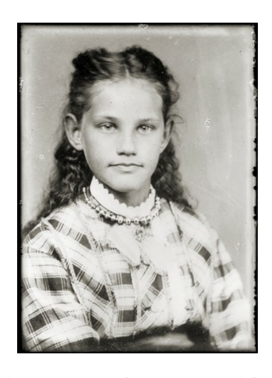
( no. 91 ) Half-length portrait of young girl with lace collar and plaid dress. Girl also appears in Brooks images 11, 14, 41, and 44.

Brooks, Burt V.: Portrait of a young woman with flowers (Greenwich, Mass.) ca.1910 18 \times 12.5 \text{ cm} . Box 6