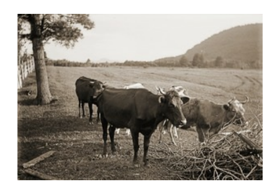
(no. 8) Small herd of dairy cows in pasture, Mt. Pomeroy in background.

Brooks, Burt V.: Cattle, Mount Pomeroy Lane (Greenwich, Mass.) ca.1910 12.5 \times 17 cm. glass plate negative Box 3