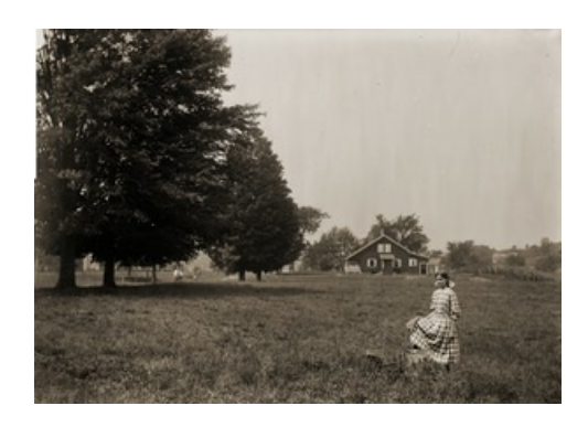
Image of young girl in gingham dress stanidng in a field in front of a house -- probably that of Ed and Nellie Green. Note: the same girl appears in images 14, 41, and 44.