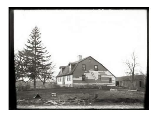
( no. 149 ) Image of house being painted, ladders propped against the side.

Brooks, Burt V.: Winter scene of house in town (Greenwich, Mass.) ca.1910 12.5 x 18 cm. Box 4