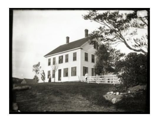
Image of an elegant house with unidentified woman standing before front door and young girl perched on a fence nearby.

Brooks, Burt V.: Unidentified family and house (Greenwich, Mass.) ca.1910 12.5 \times 17 cm. glass plate negative Box 2