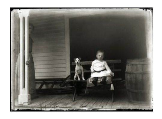
Image of young child strapped to a bench on a porch and seated next to a dog; mother standing behind a pillar at far left.

Brooks, Burt V.: Portrait of mother, children, and cat (Greenwich, Mass.) ca.1910 18 \times 12.5 \text{ cm} . Box 6