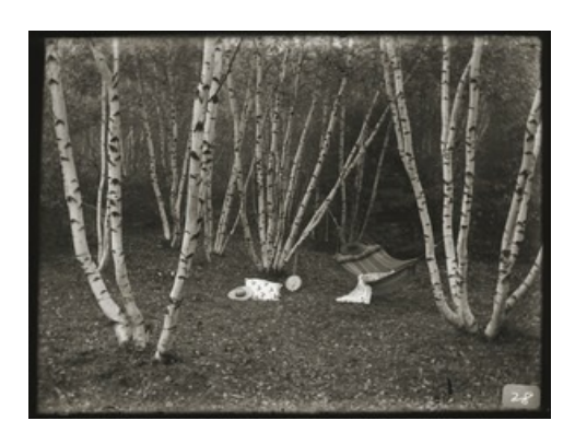
Image of a hammock strung up in a stand of birch trees, with banjo and woman's hat nearby

Brooks, Burt V.: Ice sailing on Curtis Pond (Greenwich, Mass.) ca.1910