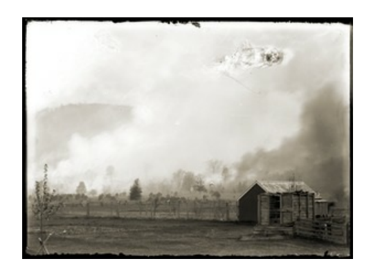
Brooks, Burt V.: Greenwich Plain looking west, with Brooks homestead in center (Greenwich, Mass.) ca.1910