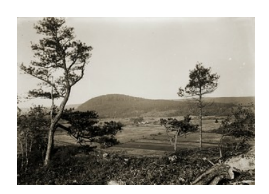
(no. 6) Panoramic view across the Swift River Valley.

Brooks, Burt V.: Masonry structure by side of pond (Greenwich, Mass.) ca.1910 12.5 x 18 cm. Box 5