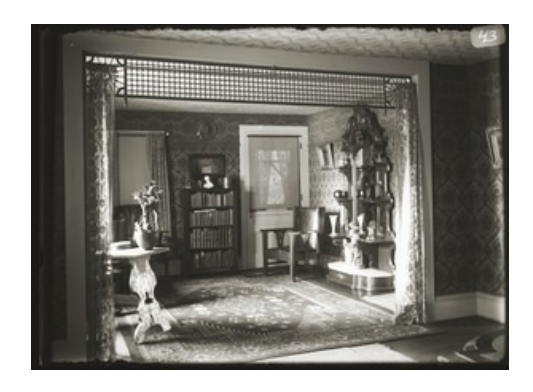
( no. 43 ) Interior of elaborate, but unidentified house.

Brooks, Burt V.: Large tree and house (Greenwich, Mass.) ca.1910 12.5 x 18 cm. Box 5