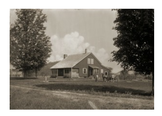
(no. 12) Rider, horse and buggy pulled up in front of house -- probably the house of Ed and Nellie Green.

Brooks, Burt V.: Horse and buggy in front of house (Greenwich, Mass.) ca.1910 12.5 \times 17 cm. glass plate negative Box 1