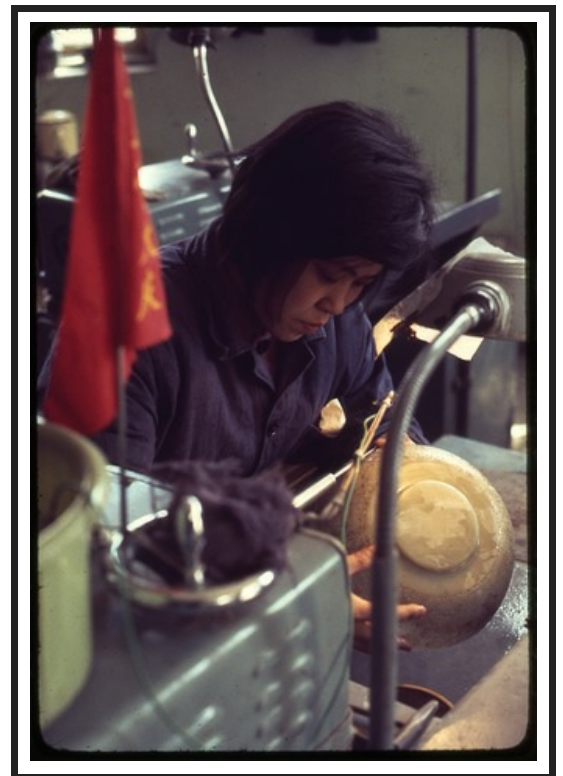
Jade worker, Hunan Province, Mar. 1977