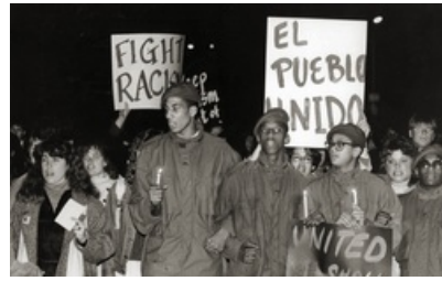
Night rally with placards reading "Fight racism" and "El Pueblo Unido"