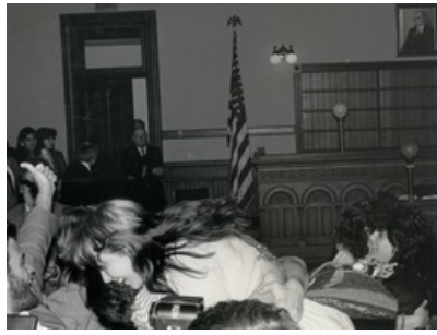
"Amy Carter Victory over CIA"