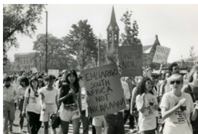
South African divestment march at UMass