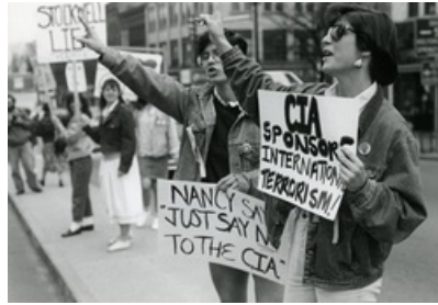
say no to the CIA," and "Stockwell lies"