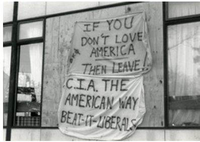
"CIA the American way, Beat it liberals"