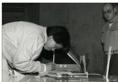
"US military recruitment on campus"