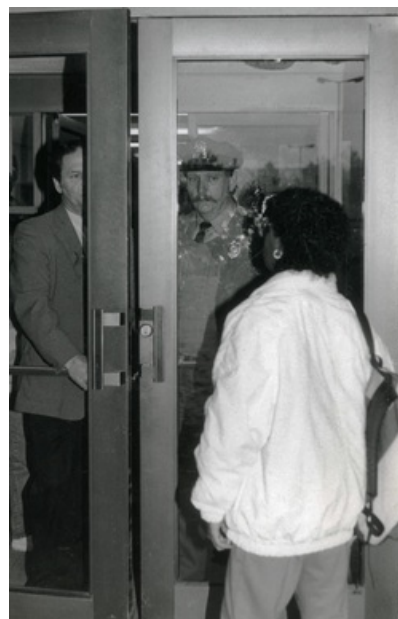
Woman greeted at door of Whitmore Hall by police officer and official