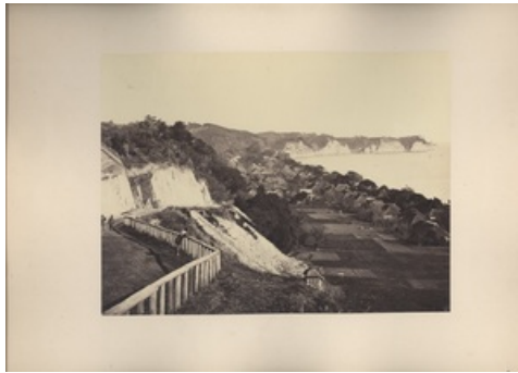
Negishi Bay from Fudozaka Slope [View on the New Road]