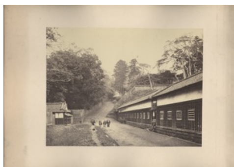
Shimabara-han Fief Second Residence