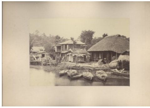
Farmhouse on canal's side