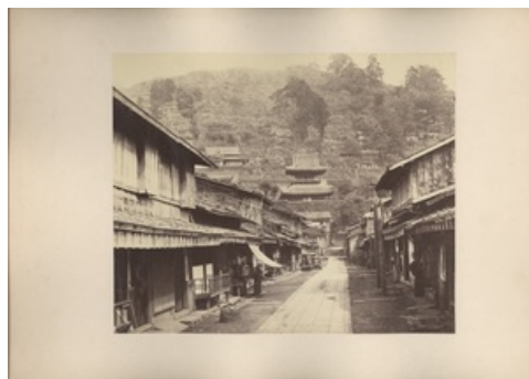
Kaisando Temple, Nagasaki