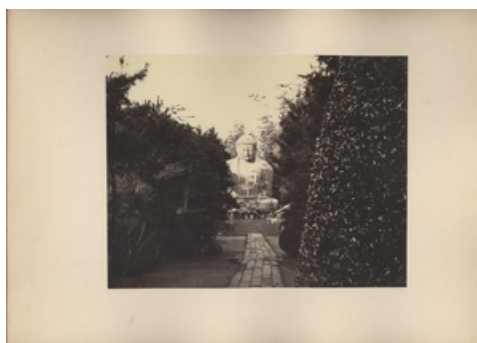
Daibutsu (the Great Buddha) of Kotokuin Temple, Kamakura ca.1866