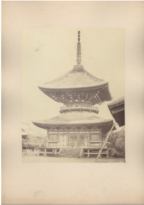
Pagoda at Kamakura