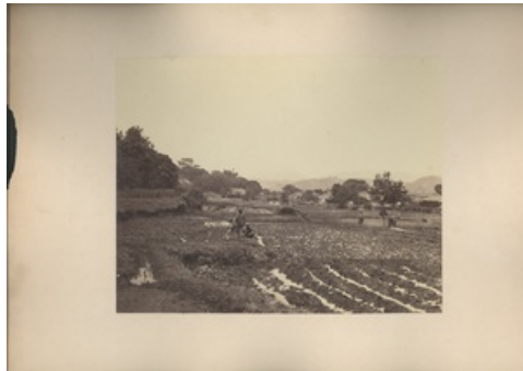
Farmers in agricultural field