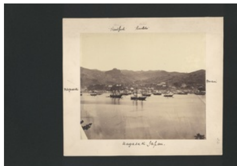
Port of Nagasaki with American and British warships