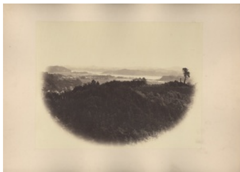
Kanazawa view from hill