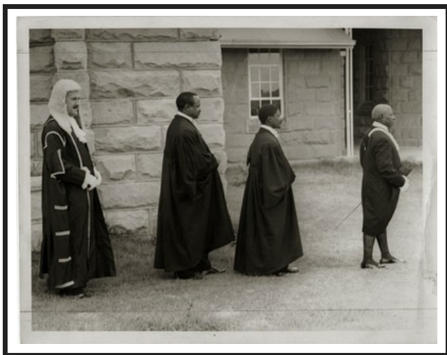
Procession in legal robes, ca. 1976

With the transformation of the African map through independence and the evolution of priorities, the AAI fine-tuned its programs in the 1970s through 1990s, sometimes narrowing its focus on specific regions. The persistence of apartheid in southern Africa and of colonial rule in Lusophone countries absorbed a great deal of the AAI's energy, resulting in the Southern African Training Program (SATP) in 1976, in which trainees from South Africa and Zimbabwe attended the National University of Lesotho, and later programs such as a USAID-funded project on development in Portuguese-speaking Africa and a training program in agriculture in Mozambique. While some program were narrowly focused, others reached out into newly emerging fields of need. In 1990, the Advanced Training for Leadership and Skills Project (ATLAS) became a force in promoting sustainable development, yielding alumni such as Nobel laureate Wangari Maathai, while between 2002 and 2007, the African Technology for Education and Workforce Development (AFTECH) applied information technologies to the need for accelerating workforce development in Africa. The AAI also increased its efforts to address women's issues in Africa, including the 10,000 Women Initiative, a 2008 partnership with the Goldman Sachs Foundation that offered non-degree and business degree training for African women.