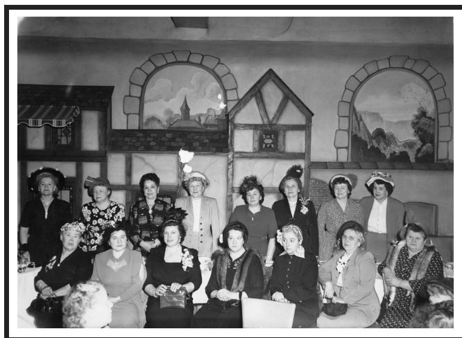
Ognisko Polek, outing to Blinstrub's Village nightclub, 1950

Compiled by Dobrowski, this collection of photographs, printed materials, and news clippings documents the Polish community in Boston during the 1930s through the 1990s. Includes photographs of the Kosciusko Monument in the Boston Public Gardens, a children's dance festival, and a Polish Women's circle outing at Blinstrub's Village as well as images of parades, receptions, and conventions.