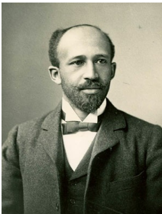
W.E.B. Du Bois, 1907

The activist, writer, and intellectual William Edward Burghardt Du Bois, was born in the rural western Massachusetts town of Great Barrington on February 23, 1868, his New England roots extending back before the Revolution and including ancestors of French, Dutch, and African American heritage. From early in life, Du Bois was recognized for his extraordinary intellectual talents. Educated in the local public schools, he graduated as valedictorian of his high school class in 1884, and with the financial assistance of friends and family, entered Fisk University as a sophomore in 1885. Thoroughly a northerner, Du Bois' experiences in Nashville were crucial in galvanizing his understanding of American race relations. To earn additional money for his education, Du Bois taught in country schools in Tennessee during the summer months, where he saw firsthand the bitter influence of segregation and the harshest expressions of American racism. The more subtle discrimination he had faced in Massachusetts coupled with this more menacing aspect encouraged Du Bois to take a more aggressive stance against social injustice.