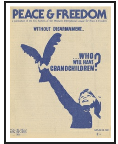
Peace & Freedom, Mar. 1980