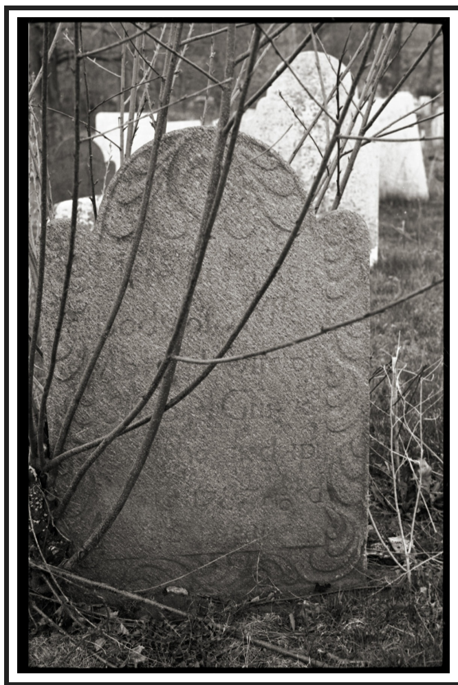
Chapinville Cemetery, Salisbury, Conn., April 25, 1974