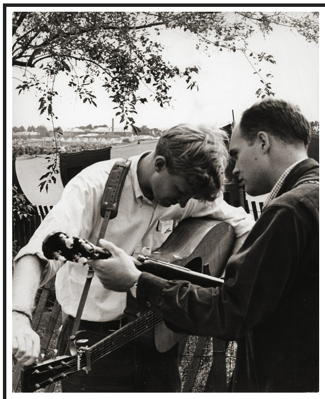
Jim Rooney, tuning his guitar, and Bill Keith at the Newport Folk Festival, 1965

After leaving Monroe, Keith joined the Jim Kweskin Jug Band for four years and expanded his instrumental range by adding the pedal steel guitar in the late 1960s. On stage and in studio he performed with a stylistically and generationally diverse range of acts over the next two decades, from Ian and Sylvia to Judy Collins, Richie Havens, Loudon Wainwright, and the Bee Gees. He was part of a short-lived bluegrass supergroup, Muleskinner, in 1973, that included Peter Rowan (guitar and signer), David Grisman (mandolin), Richard Greene (fiddle), and former Byrds guitarist Clarence White. In all, Keith performed on nearly twenty albums, beginning with Bluegrass Livin' on the Mountain , with Jim Rooney in 1963 (Prestige Folklore). He continued to perform nearly to the time of his death by cancer on October 23, 2015.