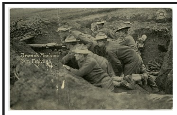
Trench machine gun fighting